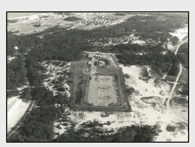
Nike Launch Facility, 1979

After WWII, the coast defenses were taken out of use, and Fort Story was increasingly used for amphibious warfare training. In another post-WWII shift, Fort Story became one of 145 coastal sites selected for the installation of the Nike-Ajax missiles and support facilities. These included the Integrated Fire Control site (which controlled radar and associated equipment), the missile launch site, and the administration area. Three large, underground missile silos were constructed at the launch site, and by 1958, were upgraded to the Nike-Hercules missile. Capable of carrying atomic weapons, the Nike-Hercules missile also provided defensive security against a wider range of aircraft. By the 1970s, the United States defensive strategy again shifted, this time away from the Nike missile program, and Fort Story's Nike facilities were decommissioned in April, 1974.