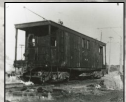
Railroad Car at Cape Henry, n.d.

Initially an isolated location, Cape Henry was eventually made accessible by rail. In 1902, the Chesapeake Transit Company constructed an electric trolley line from Norfolk to Cape Henry, and a train station was opened the same year. Development followed and by 1909, at least three hotels were operational. Guest cottages included Capps Cottage, White Cottage, and the Ferebee Cottage. the Chesapeake Transit Company erected a large, dancing pavilion in 1903. O'Keefe's Casino opened soon after and served as a venue for dances and other social events.