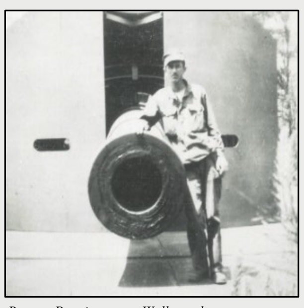
Battery Pennington or Walke, n.d.

Funding for the purposes of establishing an Army garrison at Cape Henry was appropriated in 1913, and Fort Story became a military installation in 1914. The early fort consisted of approximately 343 acres with two six-inch rapid-fire Model 1900 guns and a pair of five-inch rapid-fire Model 1897 guns, designed to operate in conjunction with four, five-inch rapid-fire guns on Fisherman Island at Cape Charles to defend the entrance to the Chesapeake Bay. By 1921, these early defenses were supplemented by the addition of two batteries consisting of two, M1920 16-inch howitzers each. These batteries were named Battery Pennington and Battery Walke.